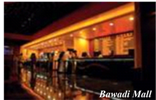
Bawadi Mall New Grand Class Cinema at Bawadi Mall

"Sharjah Chamber of Commerce and Industry"