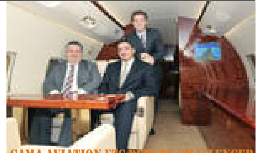
GAMA AVIATION FZC DEBUTS CHALLENGER 850 OPERATIONS IN UAE

Every year Reed Exhibitions runs more than 500 events in 38 countries, bringing together over 90,000 suppliers and more than six million buyers. With 2,600 employees in 39 offices around the globe, Reed Exhibitions serve 47 industries worldwide.