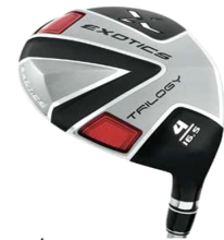
Tour Edge GOLF'S MOST SOLID INVESTMENT