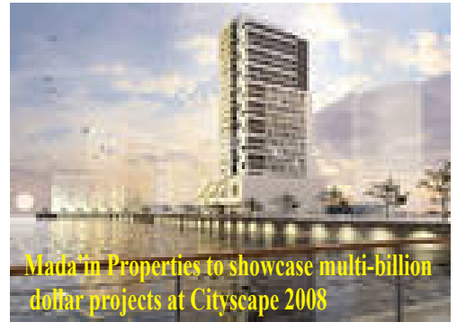
Madin Properties to showcase multi-billion dollar projects at Cityscape 2008