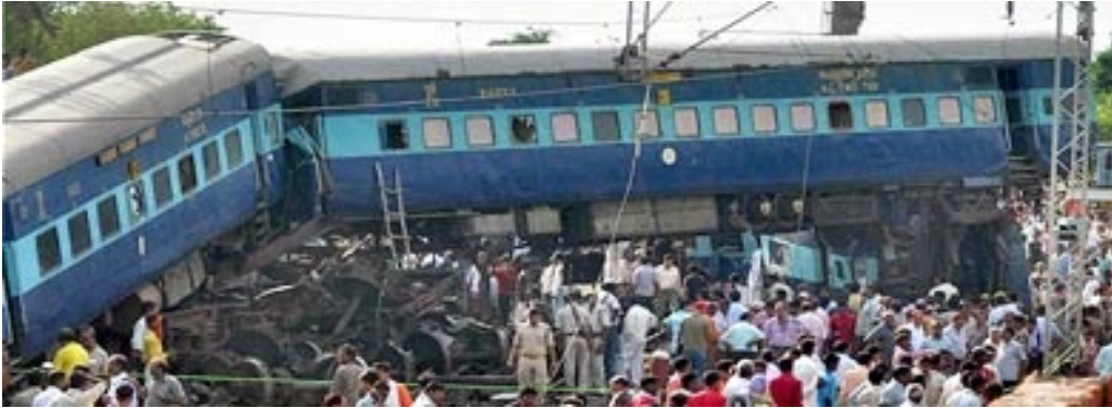
Sunday Northern India Kalka Mail derailed more than 100 passenger injured at Malwan station, near Fatehpur in Uttar Pradesh state