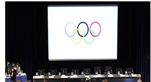
The IOC is investigating a report that rules were broken over the sale of London 2012 tickets.