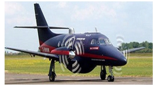
Unmanned planes could soon be used to undertake tasks judged 'too dull or too dangerous' for pilots