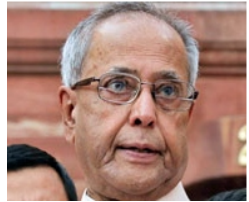
UPA-back Pranab Mukherjee filed his nomination in the presence of PM, Sonia and other allies.