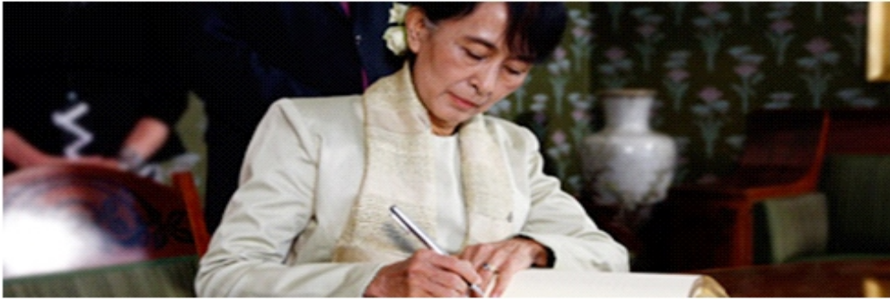
Suu Kyi finally collects Nobel Prize Burma's Aung San Suu Kyi has finally received her 1991 Peace Prize after many years under house arrest.