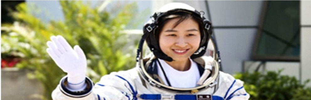
China's first female astronaut lifts off Fighter pilot Liu Yang and her fellow astronauts have blasted off in China's most ambitious space mission.