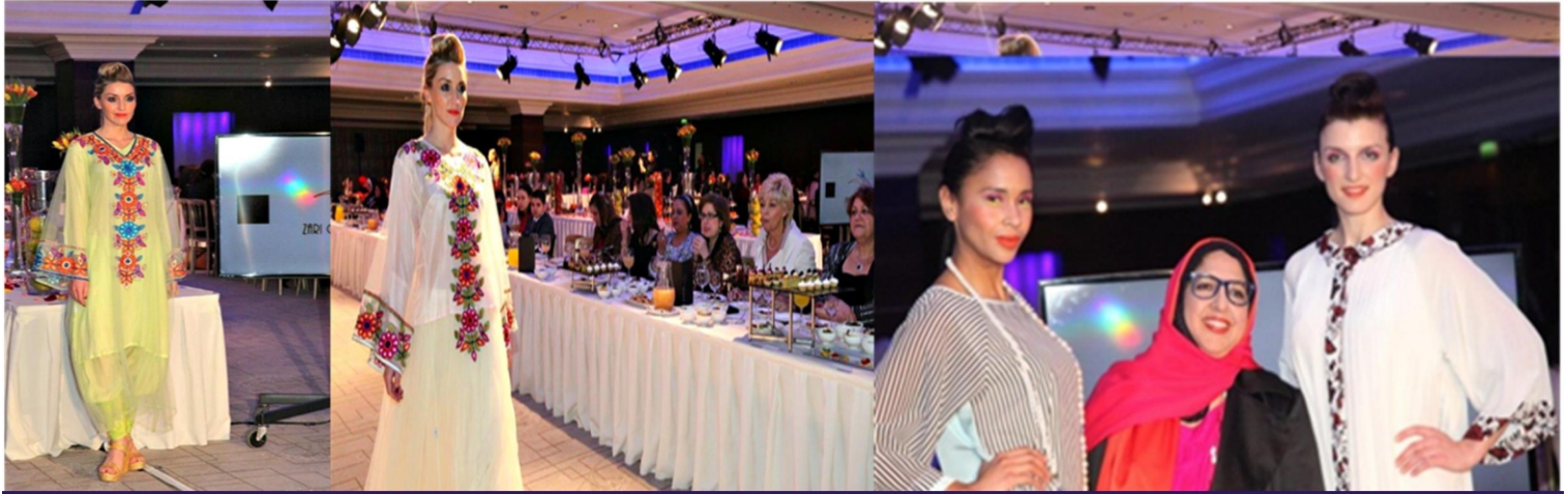
UAE's Zari O' Breesam label showcases latest creations at London Fashion Show 2013