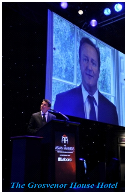
The Grosvenor House Hotel

Previous inspiring and high-profile winners have included record-breaking cricketers Sachin Tendulkar and