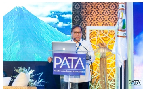
Picture: His Excellency Ramon Jimenez, Jr., Secretary, Philippine Department of Tourism providing the opening address on the “Successful Destination Marketing Campaign Trend in this digital economy” at the PATA New Tourism Frontiers Forum 2015 in Legazpi City, Albay, Philippines.