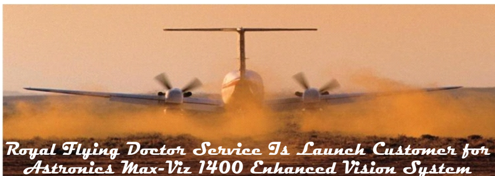
Royal Flying Doctor Service Is Launch Customer for Astronics Max-Viz 1400 Enhanced Vision System

Aside of Chicago, the company offers charter aircraft management services and a network of 10 other coast-to-coast facilities as well as a mobile line maintenance (2) service across the US. Currently it responds to around 2,500 call-outs from clients in the US every year, has flown over one million miles and driven over 500,000 to support AOG (aircraft on the ground) and line maintenance situations. The Gama Aviation brand has been operating in America since 2008 and offers a range of services from private and fleet management support and charter sales, to maintenance, parts and AOG support. Its management enjoy some 25+ years of experience in a variety of aviation disciplines.