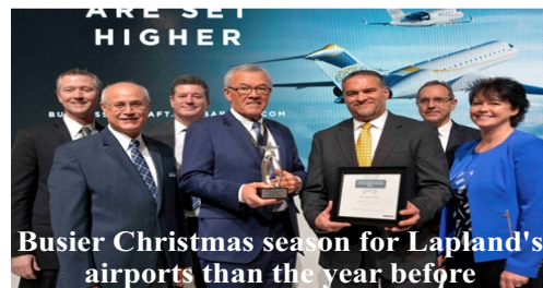
Busier Christmas season for Lapland's airports than the year before