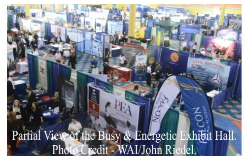
Partial View of the Busy & Energetic Exhibit Hall.