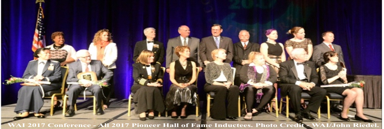
WAI 2017 Conference - All 2017 Pioneer Hall of Fame Inductees.

The 28th Annual International Women in Aviation Conference accomplished its goal to Connect. Engage. Inspire. at Disney's Coronado Springs Resort In Lake Buena Vista, Florida, March 2-4, 2017.