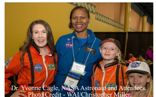
Dr. Yvonne Cagle, NASA Astronaut and Attendees.