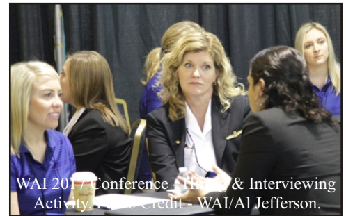
WAI 2017 Conference - Networking & Interviewing Activity.

120 scholarships were distributed to WAI members at every stage of life from university students to more accomplished members seeking mid-life challenges, advancements or career changes to aviation. A total of $643,274 in scholarships were awarded, which put the total scholarships awarded nearly $11,000,000 since the inception of the scholarship program. The WAI chapter network reached 110 global chapters as groups from as far away as Nigeria, Cameroon and Ghana participated. The 29th Annual International Women in Aviation Conference will be held March 22-24, 2018, at Reno-Sparks Convention Center. For more information, visit www.wai.org .