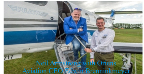
Neil Armstrong with Oriens Aviation CEO Edwin Brenninkmeyer

The Pilatus PC-12 can fly up to eight passengers in a luxury pressurized cabin, for up to 1,800 miles, at 320 mph and at 30,000 feet. The PC-12 features a generous cargo door and can operate from small airfields of 800 m, from gravel strips and grass, combining to make it one of the most versatile and practical aircraft. It can carry more payload than most for half the money.