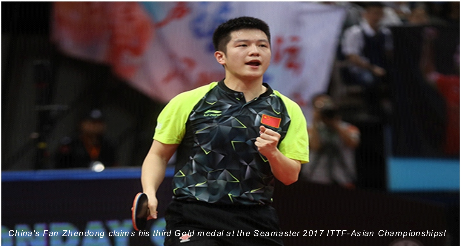
China's Fan Zhendong claim s his third Gold medal at the Seamaster 2017 ITTF-Asian Championships!