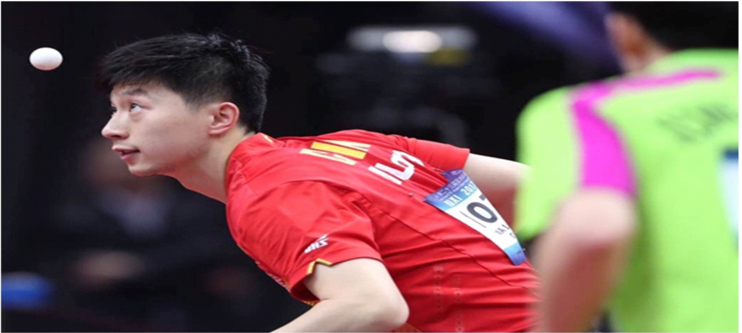
Reigning World Champion Ma Long ends his run at the Asian Championships