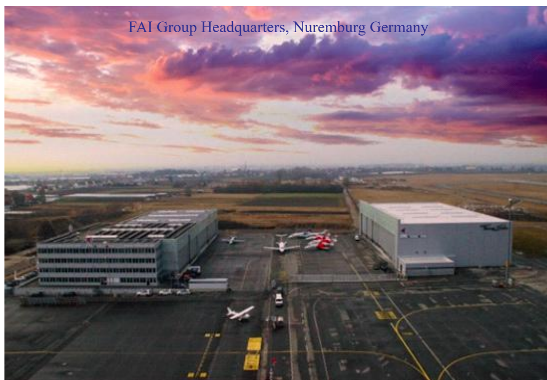
FAI Group Headquarters, Nuremberg Germany

Focus Money added their congratulations and said: "There is nothing better than