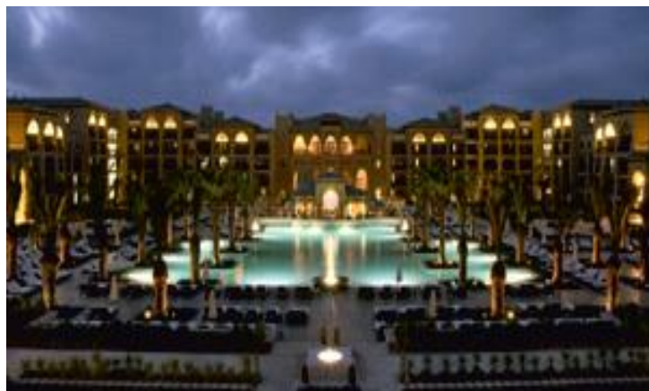
A survey conducted by American Express revealed that Morocco is a trending destination for 2019, with Mazagan Beach & Golf Resort leading the charts

Al Jadida, Morocco, 20 December 2018: New Year's is the time for people to break out of the routine and travel the world, and Morocco remains the most popular destination for tourists across the world. Maintaining the popularity of the city, Mazagan Beach & Golf Resort has crafted special deals that make the luxurious resort the best place to commence a New Year.