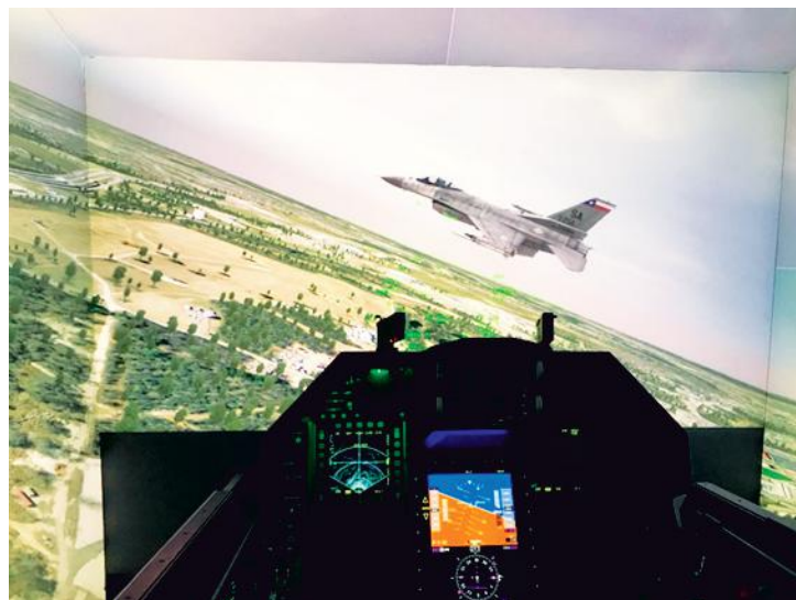
Image: F-16 cockpit view of VRSG showing geospecific 3D terrain of Kelly Field, Lackland Air Force Base, built by MetaVR for the ANG

The system simulates multiple views for the F-16: out-the-window, embedded HUD, HMD/HMIT, real-time streaming protocol (RTSP) in the central display unit, ground map radar, targeting pod, and maverick missile displays. Combined with MetaVR 3D terrain and models, cockpit displays with native 4K (4096