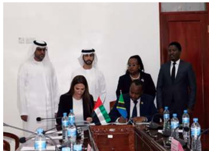
Left to right, signatory to standing: