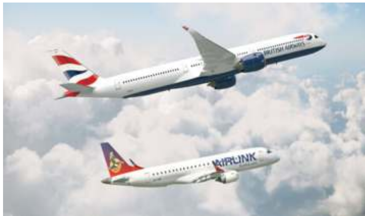
Codeshare partnership with Airlink

The agreement means British Airways' customers travelling from or transiting through London will be able to connect to their final destination via Cape Town or Johannesburg on a single ticket. This will offer more choice and flexibility for those travelling on to one of 18 towns and cities, such as Windhoek in Namibia and Durban in South Africa. British Airways currently flies twice daily between London Heathrow and Johannesburg with A380 aircraft, twice daily between London Heathrow and Cape Town with B777 and A350 aircraft and three