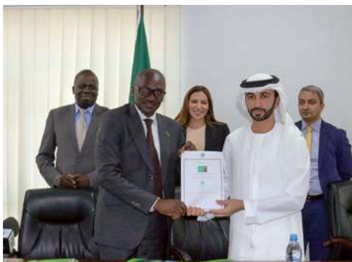
Picture of Signing- Blue Carbon Zambia

The partnership serves as an important milestone to implement decarbonization